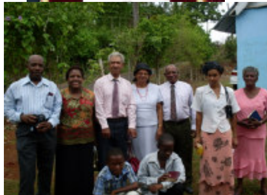
Some of Mocho Congregation