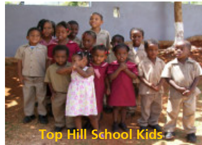
Top Hill School Kids

Everyone loved the church services. Our Christian brothers and sisters in Jamaica are very enthusiastic about praising God and enjoying fellowship together. During one of the evening services the power went out and we were in complete darkness. However, the congregation did not miss a beat. Everyone just continued to